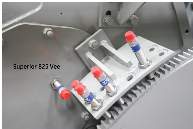
Left bank magnetic pick-up mounting bracket on Superior 825 Vee engine