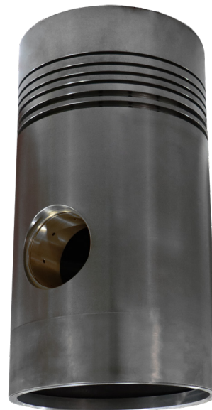
KVS Power Piston Z1687