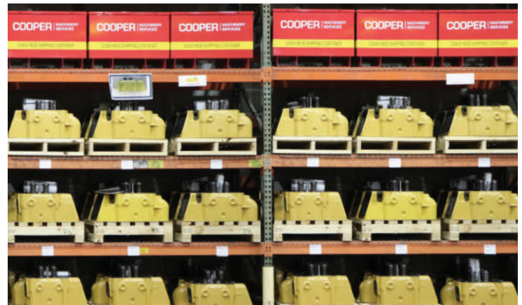
CAT G3600 Inventory

Contact your Cooper sales representative to learn more about our CAT G3600 product offerings.