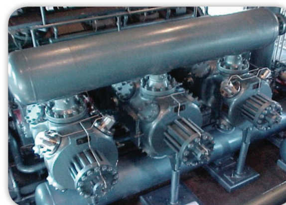
Refurbished Cylinders in Use

LEGENDS DON'T STOP. WE MAKE SURE OF IT.™