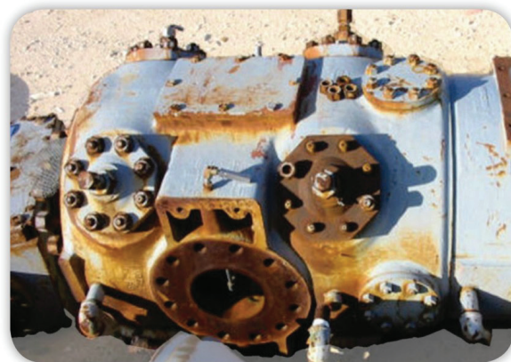
Available Used Cylinder Identified

Reconditioned cylinders go through a thorough inspection, hydro-testing, and include new components when necessary. For example, cylinders may be lined with either slip-fit liners or interference-fit liners to achieve the most efficient bore size to meet project specifications. Cylinders may be equipped with ACI's state-of-the-art performance control devices. The end result is a refurbished cylinder that meets or exceeds customer expectations.