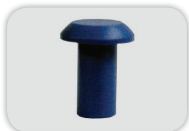
X Poppets for Long-Stem Valves