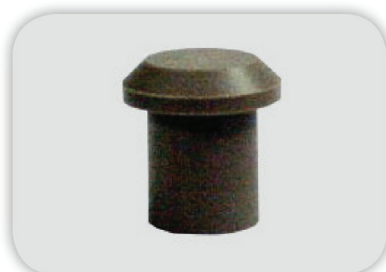
S Poppets for GAS Products High-Speed Compressor Valves