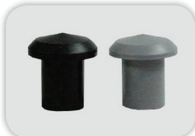
C & D Poppets