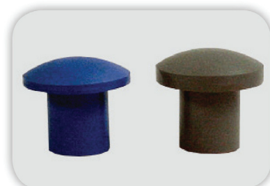
J & K Poppets for AJAX® & Cooper-Bessemer® Valves