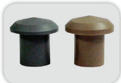
A & B Poppets for GAS Products Valves