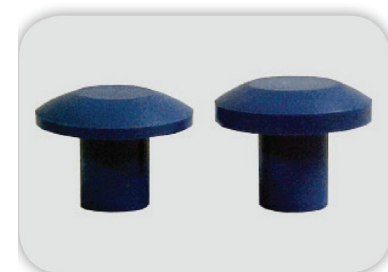
T & W Poppets for Clark Valves